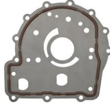
aluminium-FKM 343 017