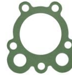
paper 341 332